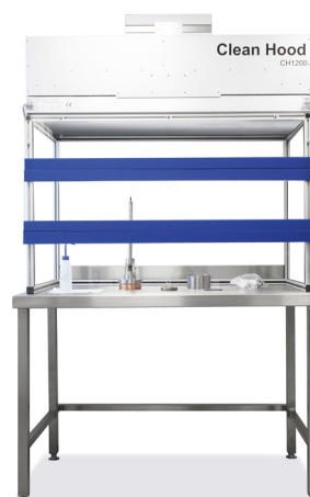
Integrity Clean Hood