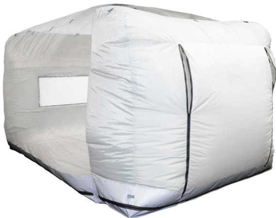
Integrity Modular Cleanroom**